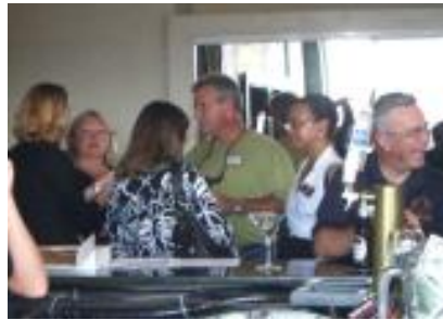
Meeting New Members