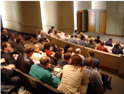
Members listen to information about the Garmin Campus in the auditorium