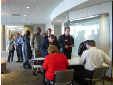
Members checking in at March program