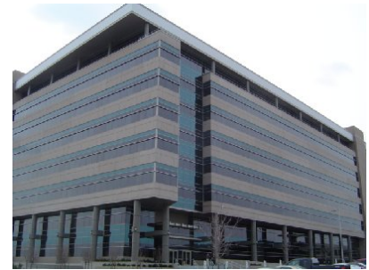
Garmin Industries Building