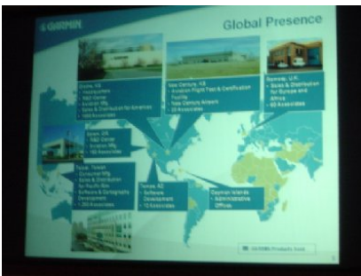
Global presence of Garmin's services