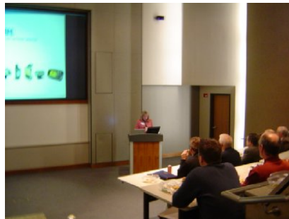
March Meeting at Garmin