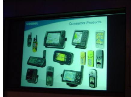
Exhibit showing Garmin products