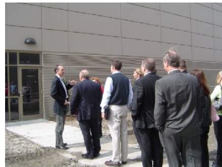
Chapter members on tour of Garmin Industries