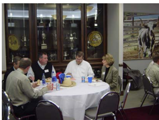
Members enjoy a lunch before the October Chapter Meeting.