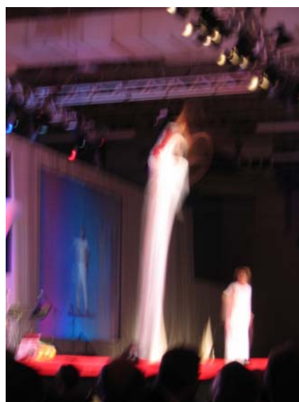
Did you see "Ghosts" at the Awards Banquet?