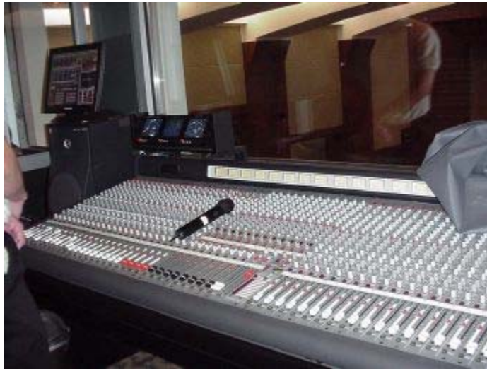
More buttons than you can imagine.