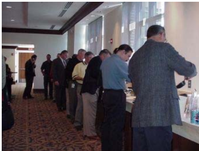
The food line.