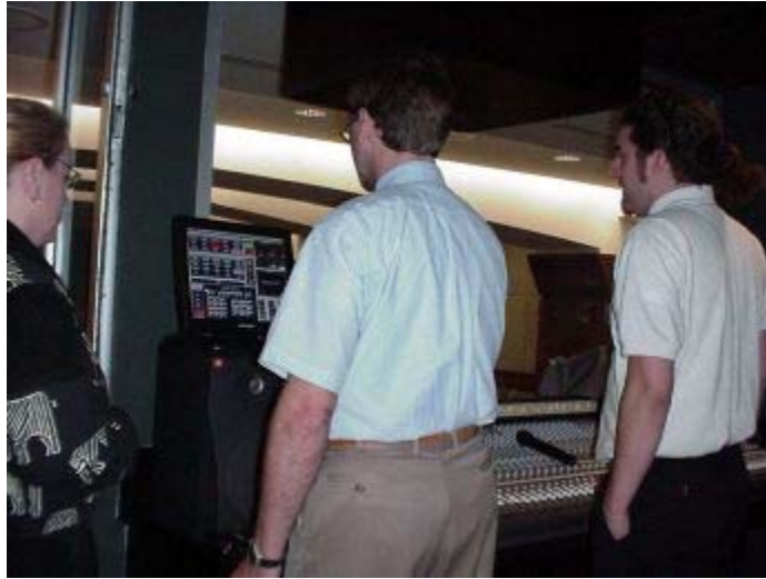
The control room where everything happens.