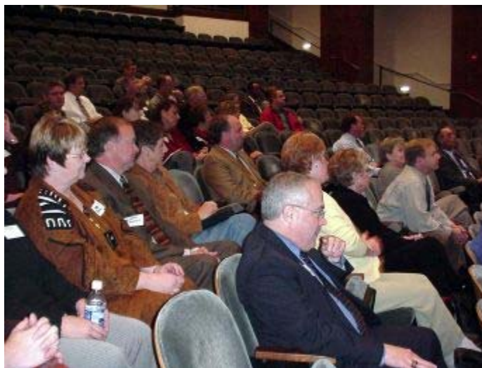
KC members in audience.