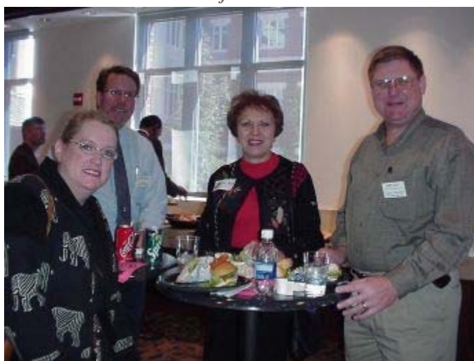
Members enjoy lunch.