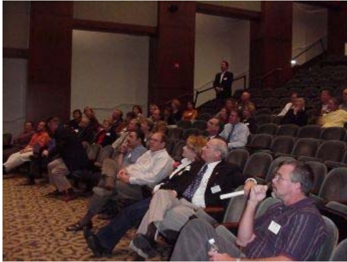
Audience listens to Omaha chapter.