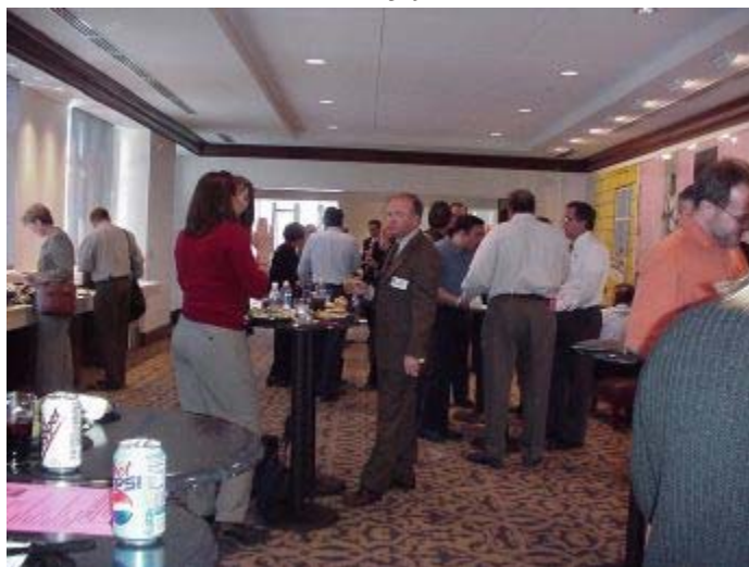
Lunch and networking.