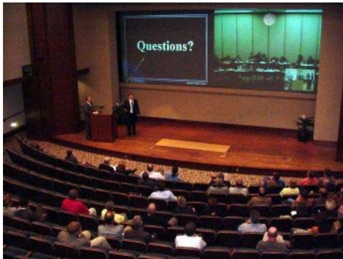
Interactive questions from KC to Omaha.