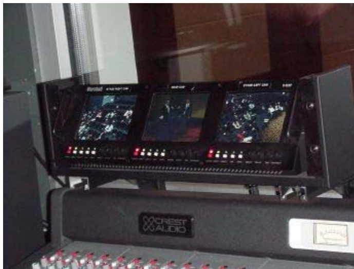
Controls show all venues.